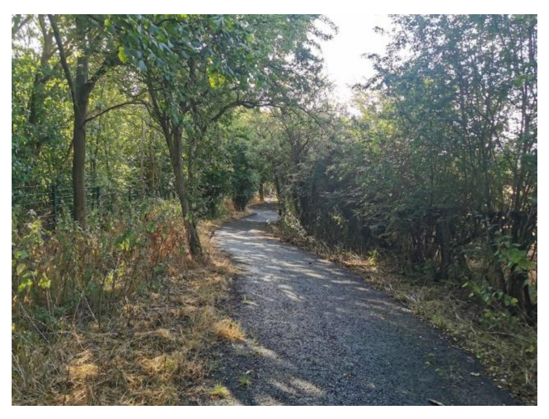
Vegetation Maturing Along the Path